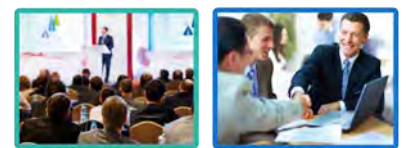
Even in large spaces