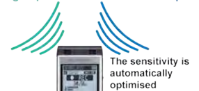
Even in small spaces