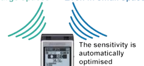
Even in small spaces