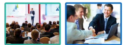
Even in large spaces